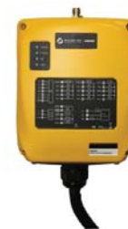
FLEX EX 4/6 RECEIVER

Flex EX receivers were designed with field installation and serviceability in mind. Receivers come prewired with 6' of cable and mounting hardware allowing fast installation. Onboard diagnostic and output LEDs provide system status information useful when installing and troubleshooting. All components are easily accessible and field replaceable. IP66 rated fully sealed receiver enclosures provide you with confidence and protection in the harshest indoor or outdoor environments.