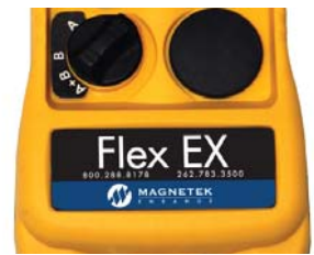
Selector Switch Available on A/B and Tandem Models

A three-position selector switch allows one operator to switch operation between two trolley/hoists (A, B, or Both) that are located on a single bridge. The operator can easily identify which trolley hoist is active on the crane by the position of the selector switch.