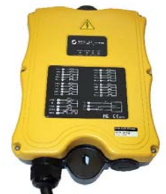
FLEX EX 8/12 RECEIVER

For more information, contact Magnetek Material Handling or your local Magnetek Sales Representative.